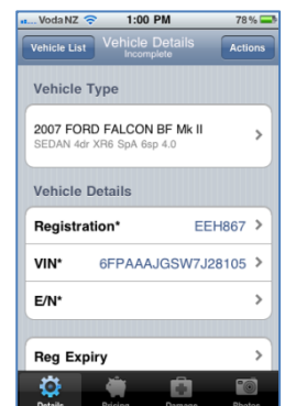
Photo and damage capture